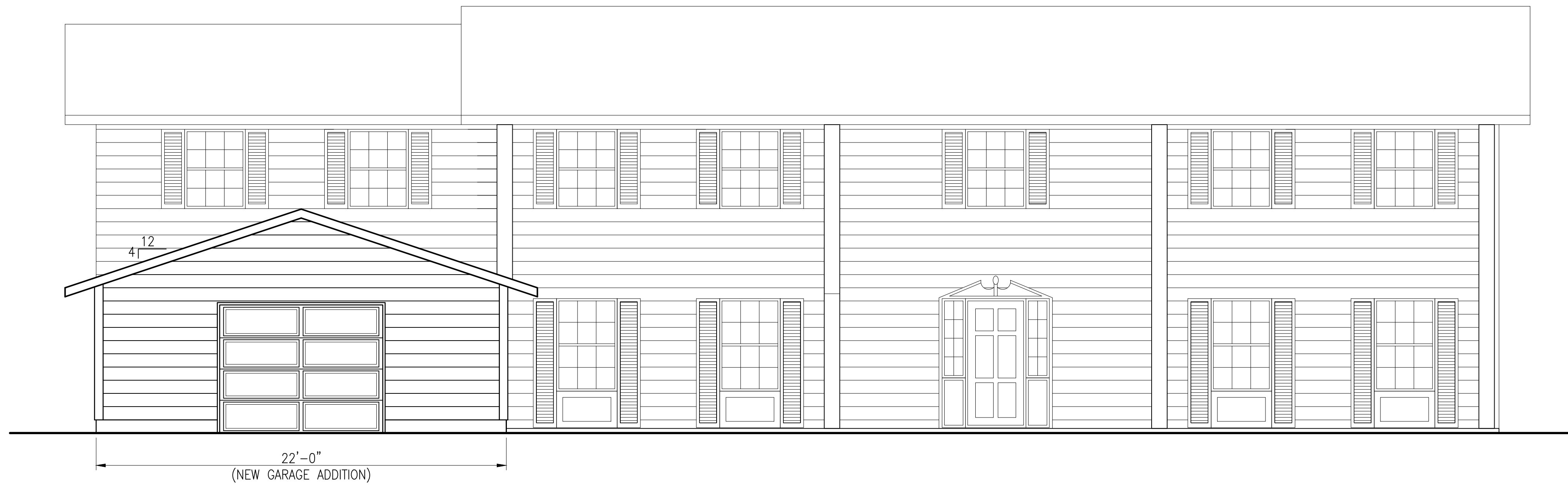
FRONT – EAST ELEVATION SCALE: 1/4"=1'-0"