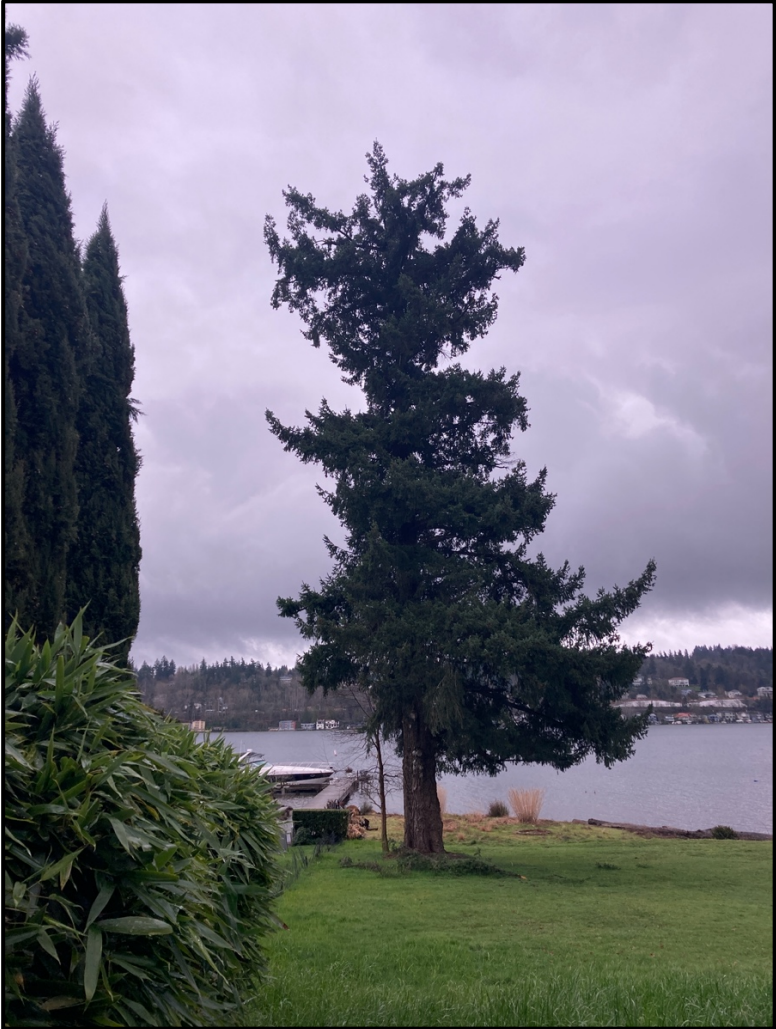
Photograph 4. Tree 275, and exceptional Douglas-fir with windblown canopy that is proposed for retention.