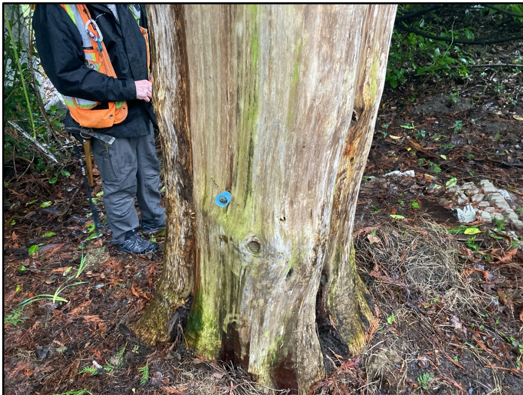
Photograph 3. Dead tree 2, a dead western redcedar with funnel and signs of intentional girdling.