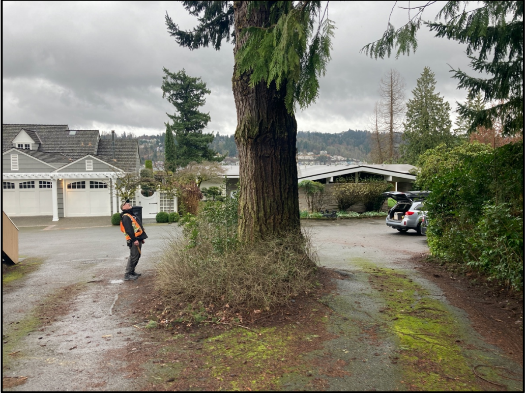
Photograph 1. Tree 573, An exceptional Douglas-fir in the NW corner of the lot. This tree conflicts with required driveway improvements and new fire-hydrant.