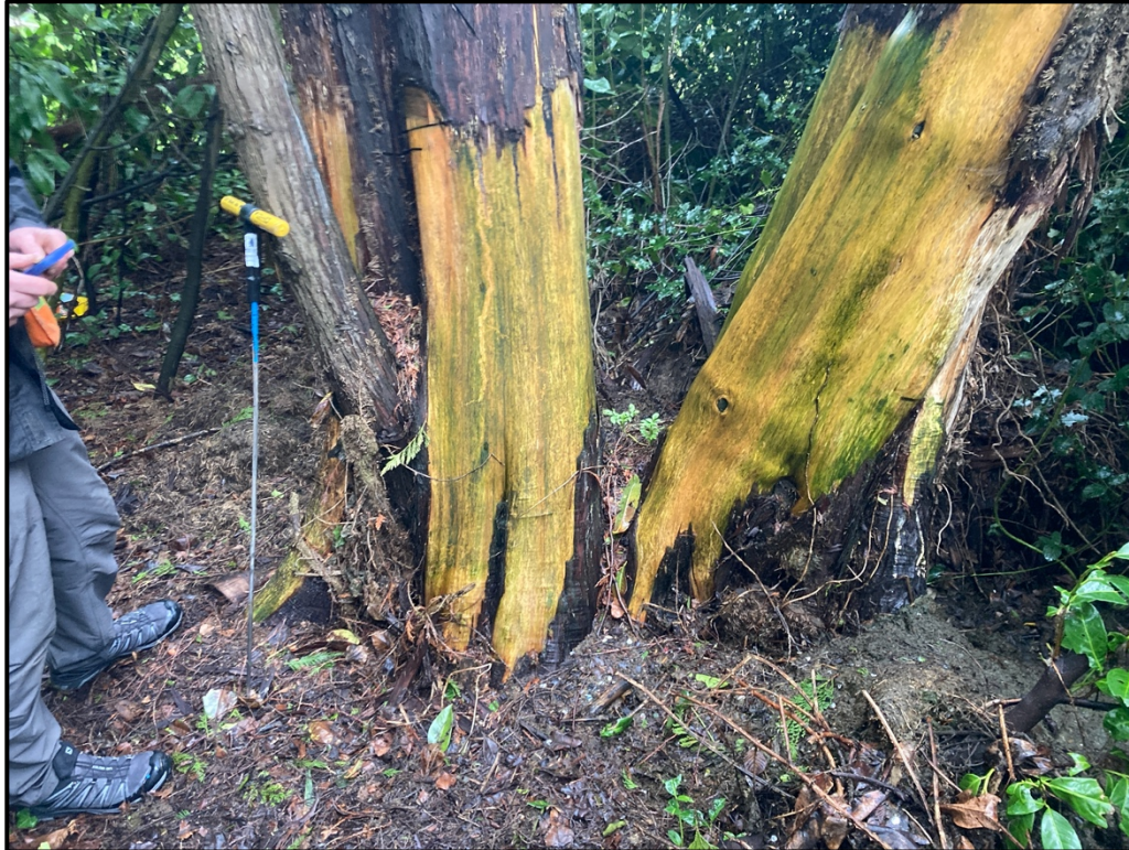
Photograph 2. Dead tree 1, An exceptional western redcedar that appeared to have been girdled by the previous property owner.