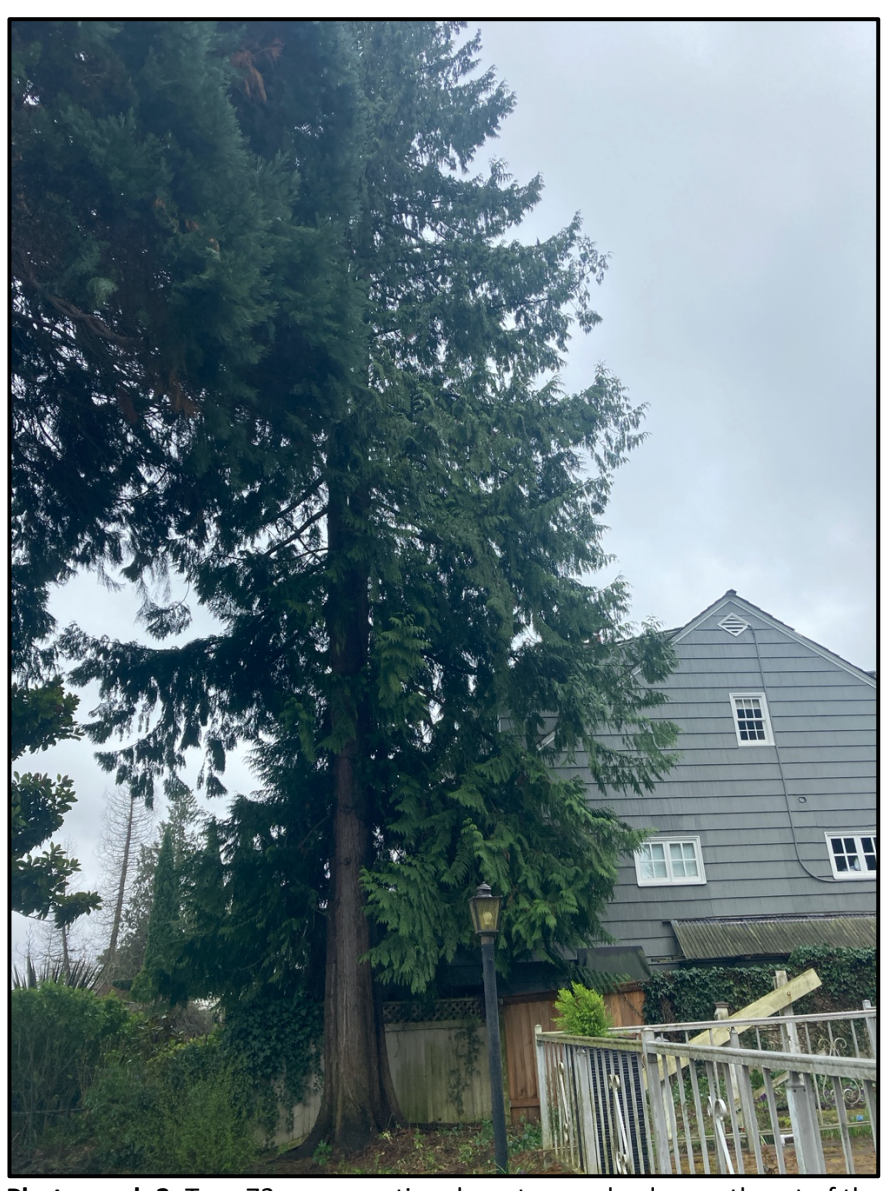
Photograph 2. Tree 73, an exceptional western redcedar southeast of the existing house.