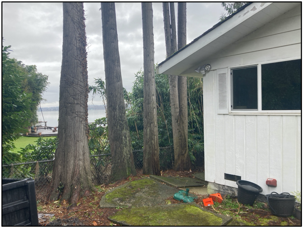
Photograph 5. Trees 80 through 83, four western redcedars immediately north of the house. These trees must be protected at the edge of the existing hardscapes for the duration of the project. Any leveling of the concrete pavers must be achieved through fill only.