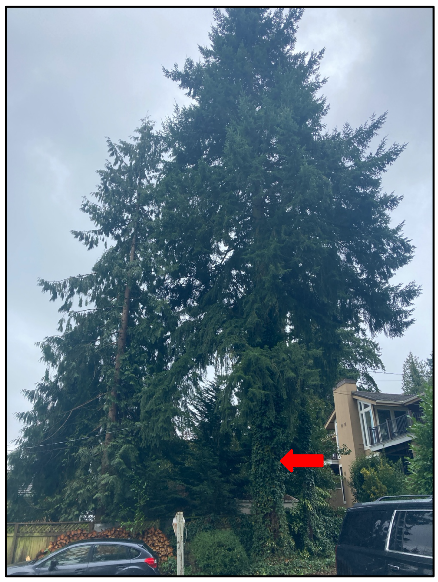
Photograph 1 . Tree 72, an exceptional Douglas-fir (Indicated with red arrow) in the southwest corner of the lot. This tree can be protected at the edge of the existing hardscapes. The English ivy should be removed from the trunk.