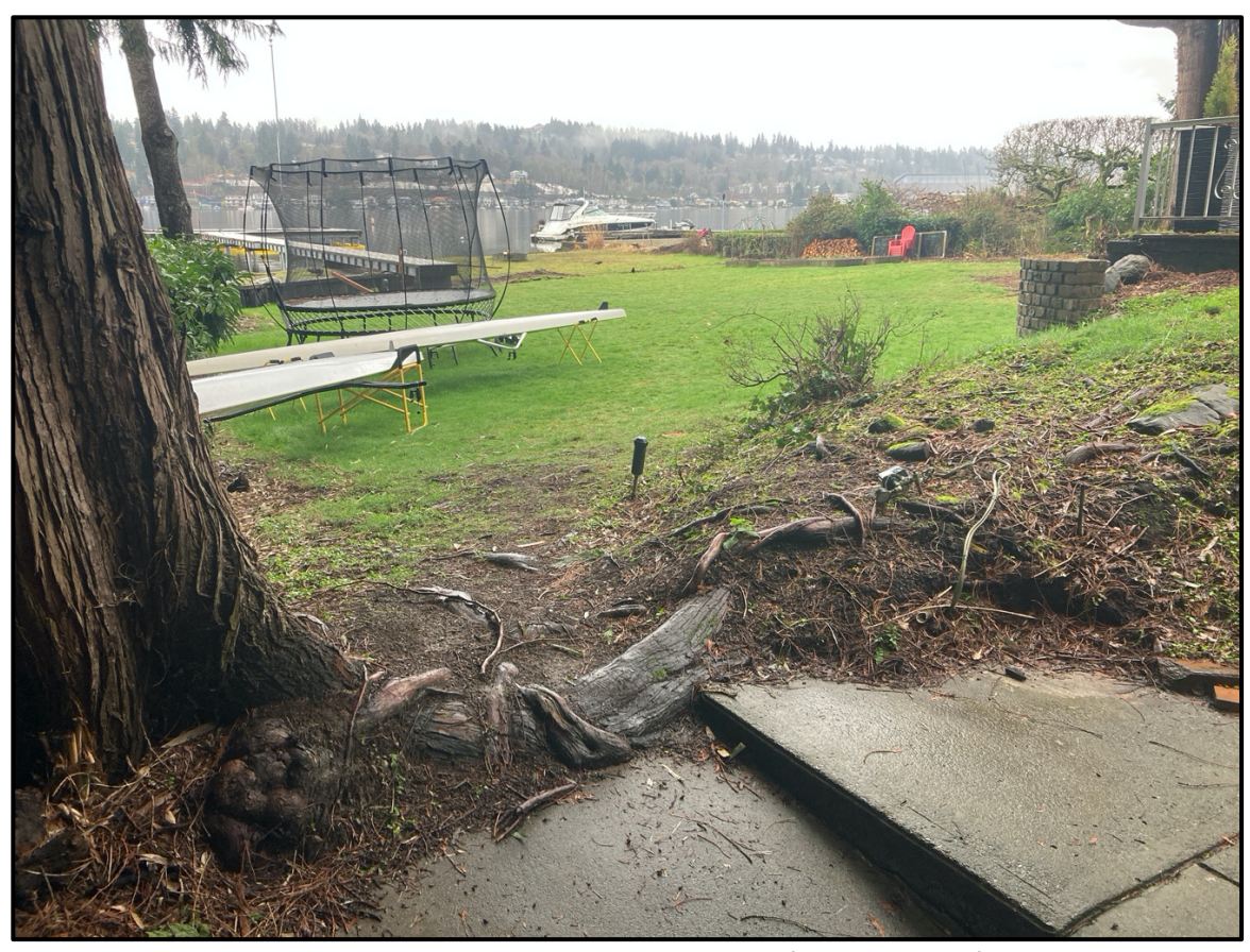
Photograph 4. Tree 79, a 29-inch western redcedar with significant root conflicts with the patio and concrete path. This is the only large tree currently proposed for removal.