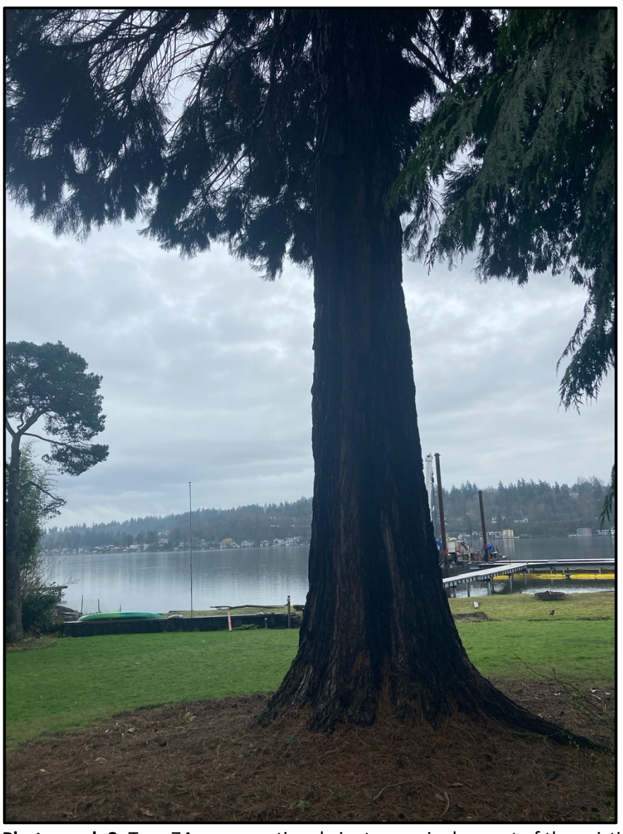
Photograph 3. Tree 74, an exceptional giant sequoia due east of the existing house.